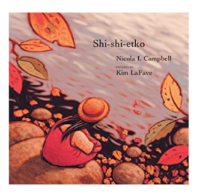
SHI-SHI-ETKO By Nicola Campbell